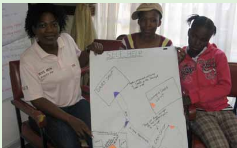
Youth Co-operatives Conferences, Lesotho. ‘What does your co-operative mean to you?’