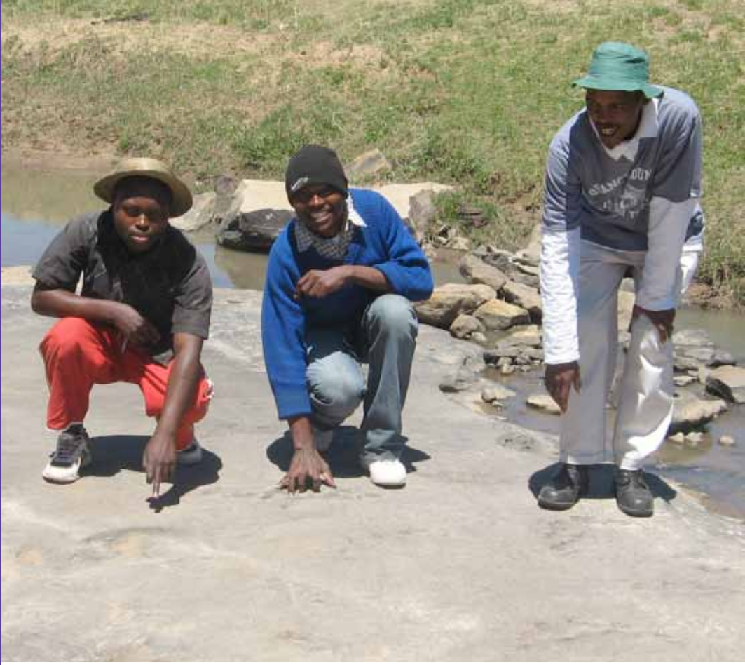
Subeng Dinosaur Youth Co-operative, Leribe District, Lesotho