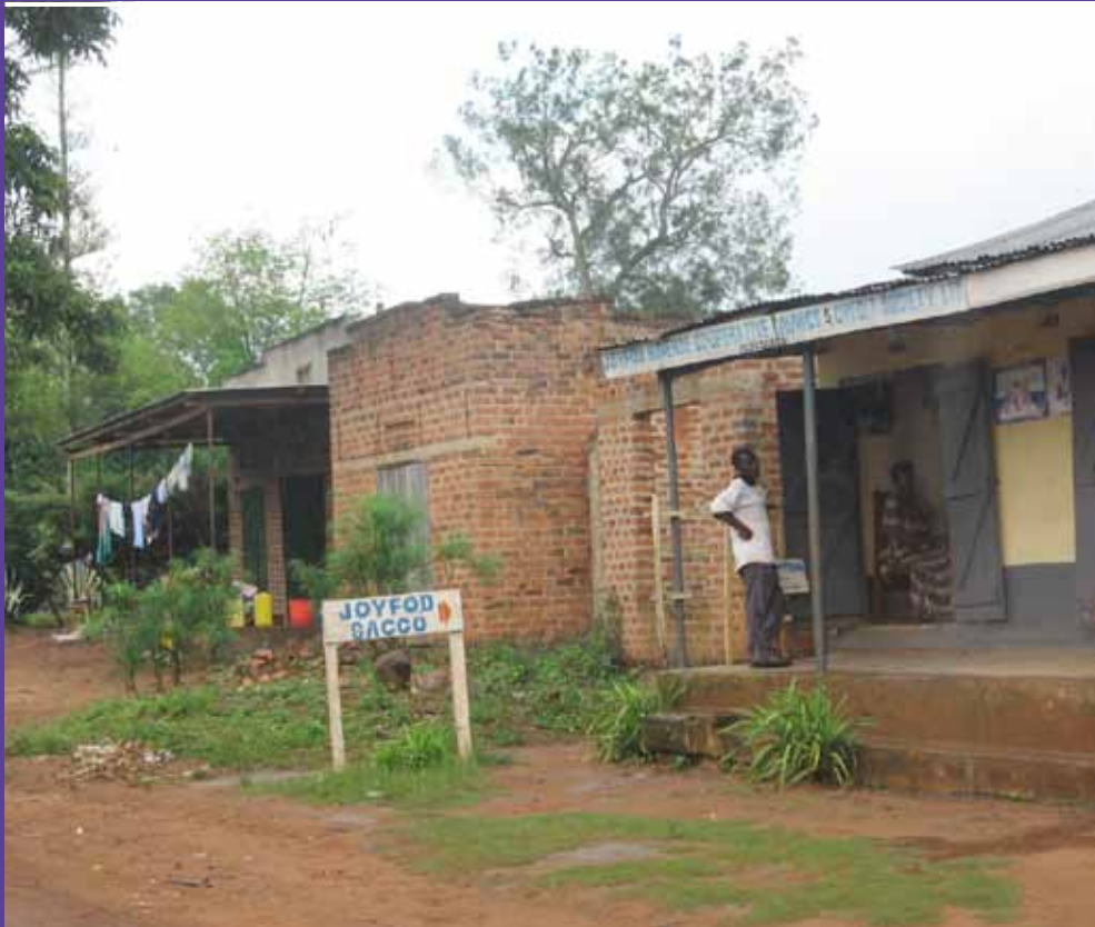
Front of JoyFod SACCO, Buwenge Sub-County, Uganda

Both of these co-operatives are registered with the Department of Co-operatives and are also a member of the umbrella organisation for co-operatives Uganda Co-operative Alliance (UCA).