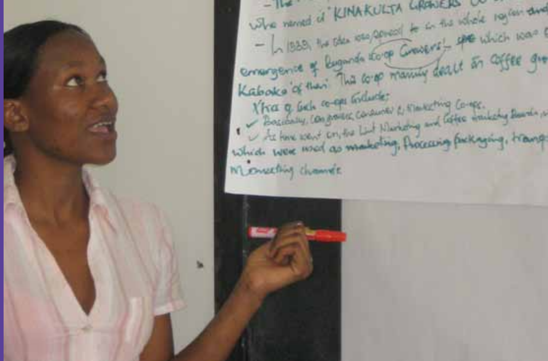
Student at the Co-operative College in Uganda

In Uganda, College students learn through a work placement where they spend several weeks working in a co-operative or related public or private sector organisation. Students emphasise the importance of the placement as it provides a chance to get some valuable on the job training.