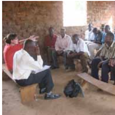
Above left: Centre of Kayunga district, Uganda