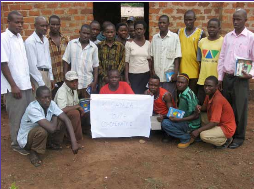
Kigayaza youth co-operative, Kayunga District, Uganda

Kigayaza Youth Co-operative faces challenges. It is difficult to recruit female members, to mobilise some members and find resources to further the co-operative. In particular, it needs money to build a store which will better equip it to combine (bulk) their crops and wait for a better price and also buy a mill for its maize crop, which would enable it to add value to maize by milling and packaging it. They also lack a central office and do not have staff, the board co-ordinates and conducts activities. They have appreciated and been motivated by the YEECO project and are concerned what will happen now that it has finished. That said, Kigayaza has a strong leadership and motivated members, many of whom know and are committed to their co-operative being independent, democratic and autonomous and running according to the co-operative principles and values.