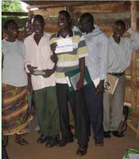
Business Plan training, Uganda