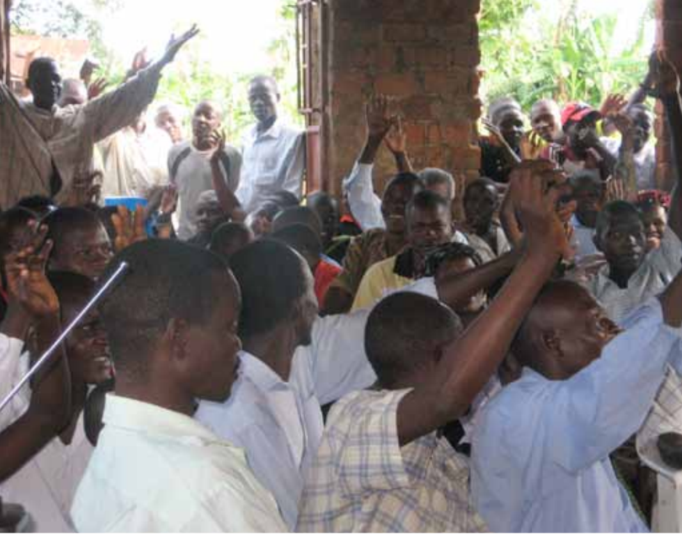
Young co-operators voting in leadership elections at their Annual General Meeting in Uganda

“The question of youth co-operatives is critical because it is not just learning how to do Co-operative business, but the values and principles which go with it, which create a vision of a just society in the minds of youth.”