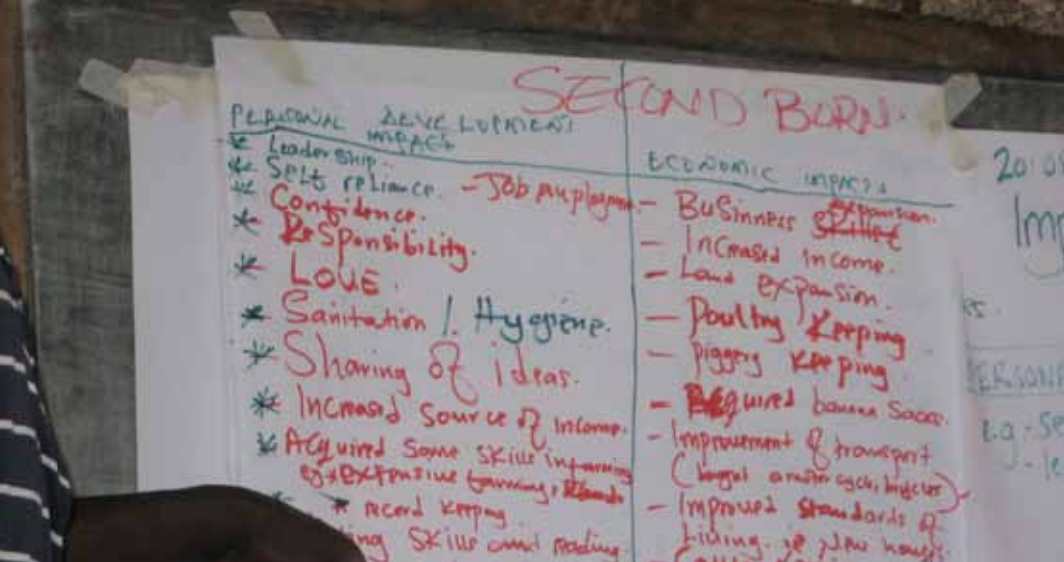
Focus Group Discussion with youth co-operatives in Uganda