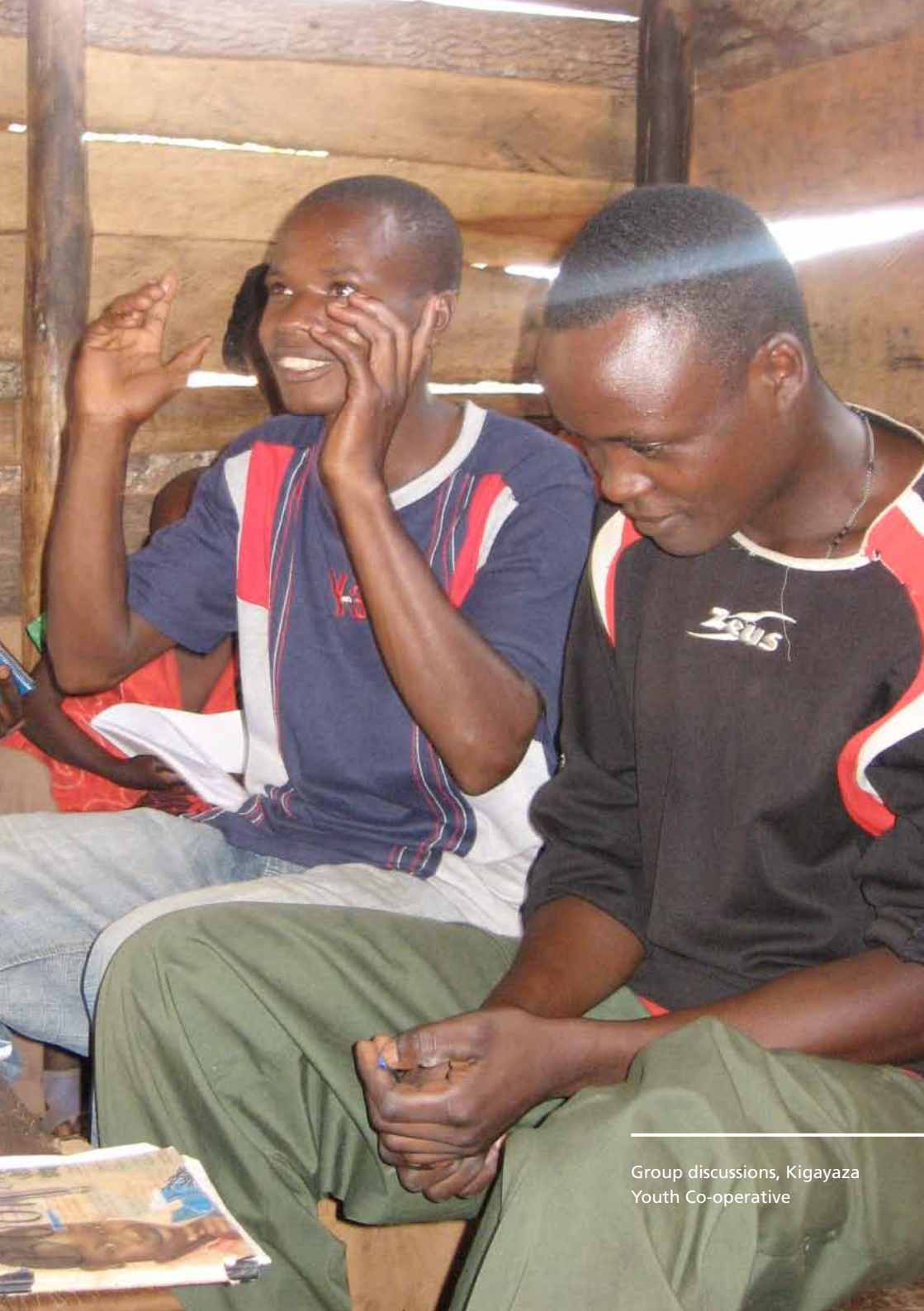
Group discussions, Kigayaza Youth Co-operative