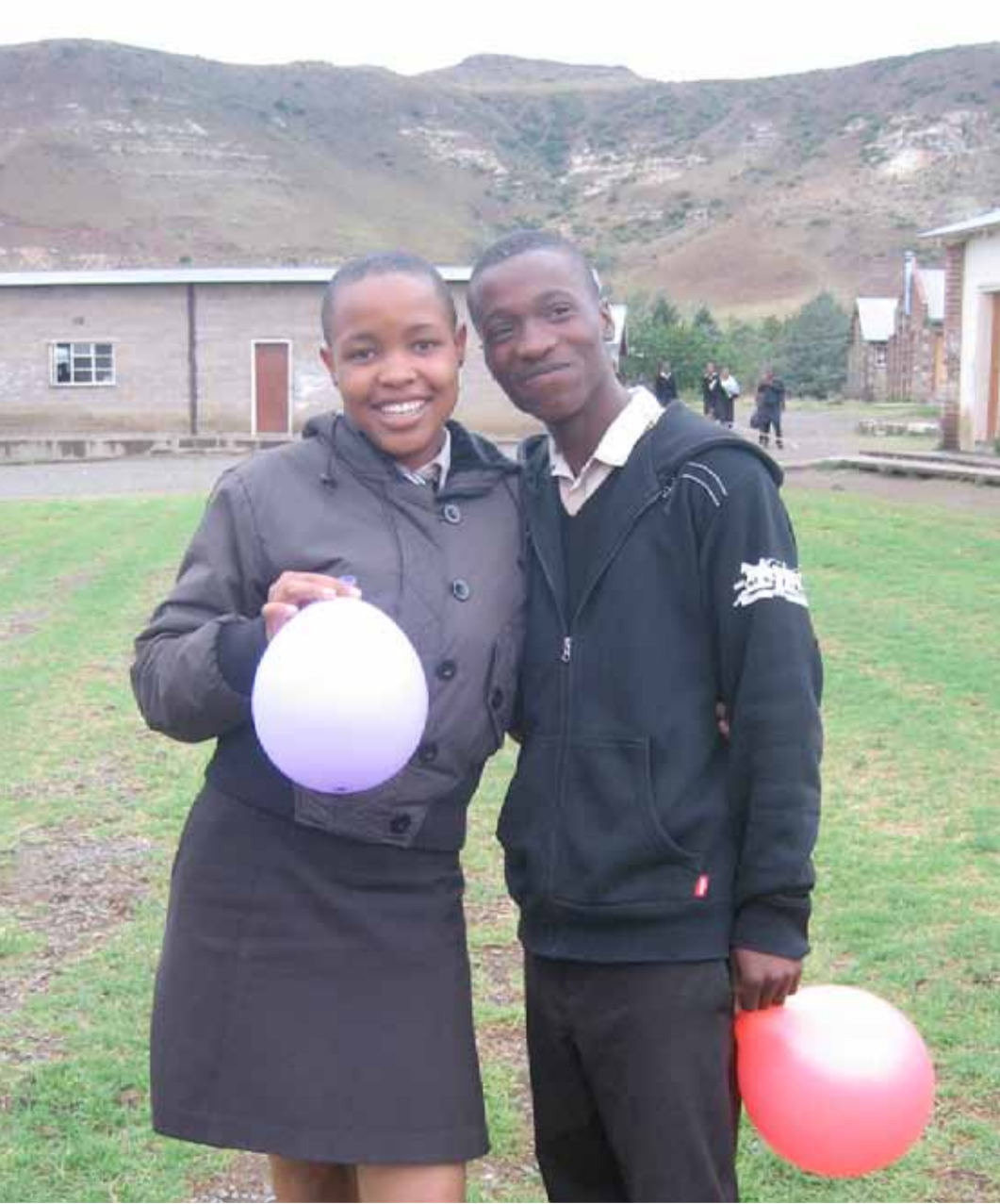
Mr and Miss Co-operative, Rise and Shine student co-operative, Mοhales Hoek, Lesotho