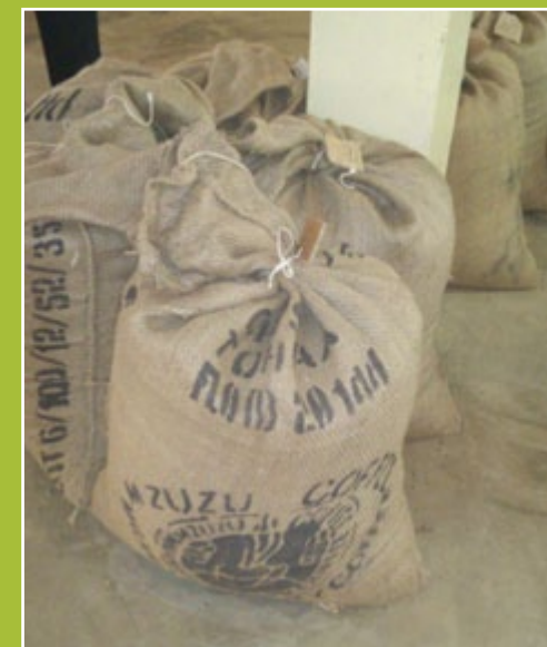
Coffee beans in sacks

MZCPCU has a positive relationship with the government. The Ministry of Industry and Trade has assisted the Union with expert advice and let it pursue its own organisational agenda. A representative of this ministry sits on MZCPCU's board along with a representative of the Registrar of Co-operatives. Both representatives provide expert advice on behalf of the government. The Ministry of Agriculture has lent its backing to project proposals for external funding, such as ones made to the European Union.