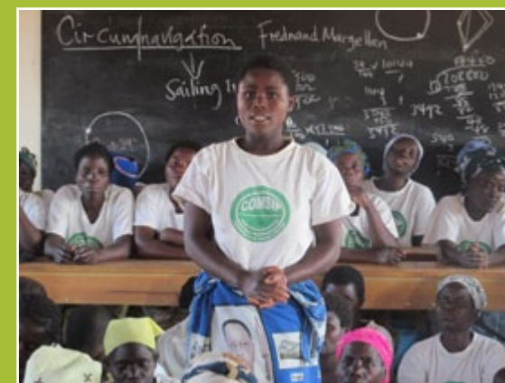
COMSIP women in classroom

COMSIP co-operatives are registered under the Co-operative Act. They are regulated by the Department of Co-operatives in the Ministry of Industry and Trade. The Union benefits from government support in terms of extension services and co-operative education. Although useful, it has the contradictory