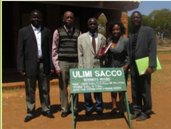
Members of ULIMI SACCO

affecting the company or the production or marketing of the crop would directly have an impact on the SACCOs and consequently on the Union.