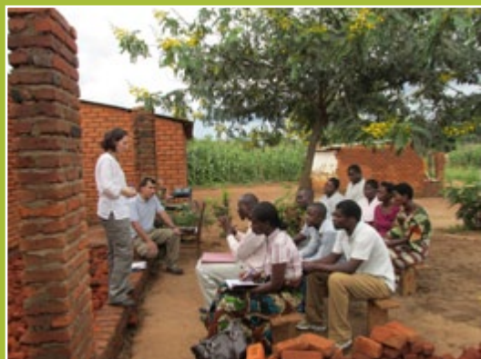
Left: Authors conducting a focus group.

In this respect, the role of the Unions emerges as being of critical importance. In fact Unions can provide co-operatives with services and strategic partnerships which can make the difference in order to develop sustainable businesses. It is for this reason that four co-operative unions were chosen as the focus for this study.