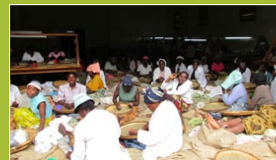
Women sorting coffee

MZCPCU is now part of an international commodity value chain that enables members to access Fair Trade markets and international retailers, such as major UK supermarket chains. Access to these markets was the result of MZCPCU's partnership with Twin Trading. Twin Trading provided training in sustainable farming practices which in turn increased coffee productivity and quality. Twin Trading has also been the first organisation to encourage MZCPCU to work specifically with women.