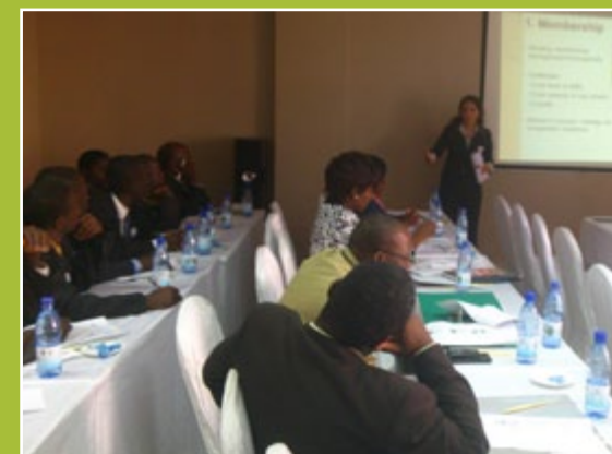
Workshop with Malawian co-operators

Sharing the findings with the workshop participants added to our understanding of the factors affecting the resilience of the Malawian co-operative movement. Discussions were both constructive and lively.