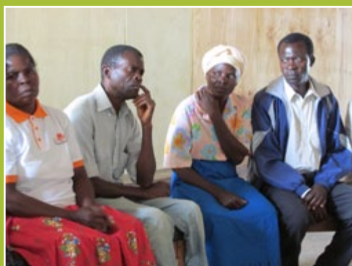
Below: People participating in the focus group.